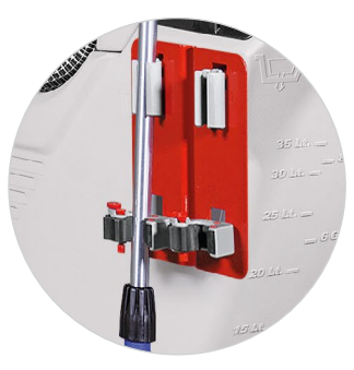
KIT FOR CLEANING ACCESSORIES For bringing additional cleaning tools with you, which are useful for completing the operations (upon request)