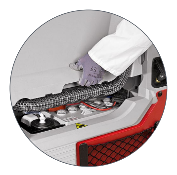
Full access to components makes easier both regular and extraordinary maintenance.

For this reason, the parts requiring daily maintenance are distinguished by their yellow color. In this way, the operator can easily identify the parts to be sanitized at the end of the shift.