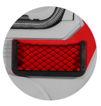
ELASTIC NET AS OBJECT HOLDER The side elastic net can be used to carry additional cleaning tools that allow to complete the cleaning operations