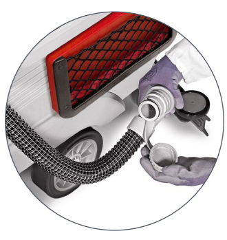
The large diameter of the drain hose allows to quickly empty the recovery tank.