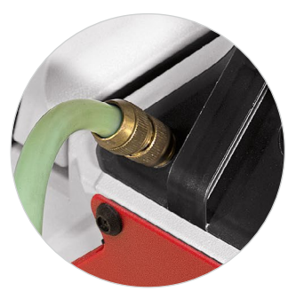
FAST FILL A simple device allows the quick filling of the tank with clean water without the presence of the operator (upon request)