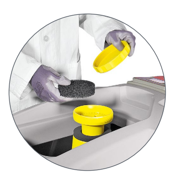
For an effective vacuuming the suction filter must be kept clean.