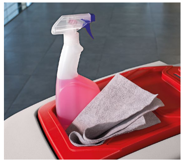
Versa solution tank has a measuring cap that The recovery tank lid can hold small objects.