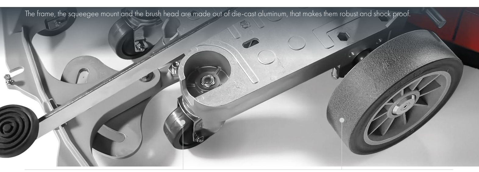
The 4 wheels increase stability and manoeuvrability. Moreover, they make brush maintenance easier and allow to store the machine with the brush head up, to keep the brush in perfect conditions.