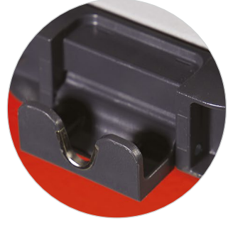
TOOL-HOLDER HOOK It can hold the squeegee or the tank lid, useful for machine store or maintenance (upon request)