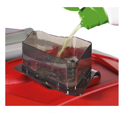
Versa solution tank has a measuring cap that helps to add always the proper detergent amount.